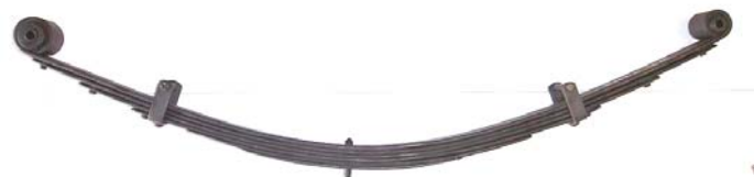
LEAF SPRING PHOTO 3-B